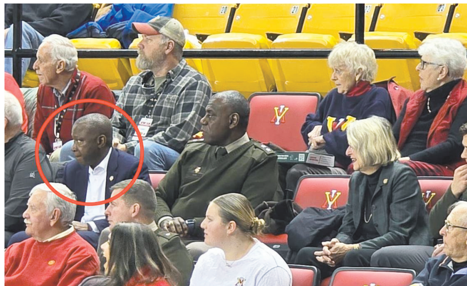
Democratic Speaker of the House Don Scott (circled) with Maj. Gen. Wins at the VMI basketball game 25 Jan 2025 the day after the Senate Committee removed Elliott and Foster from the BOV and two days before the House took up the nominees

Public records also show that during the same 2021 - 2024 period, Foy received $200,000 from the Defeat Republicans Political Action Committee, $1,080,000 from the liberal-leaning Clean Virginia Fund, and $750,400 from S. Sonjia Smith. The billionaire couple Son-