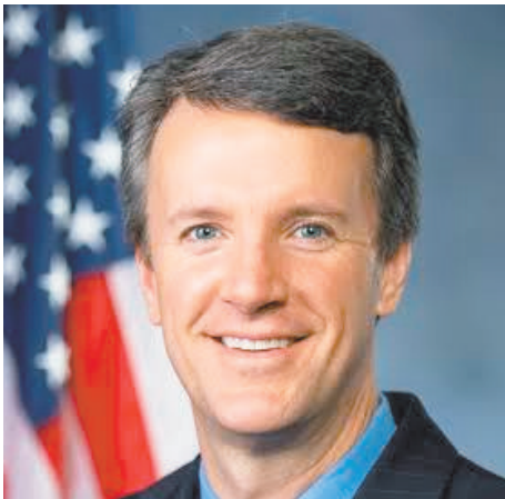
Congressman Ben Cline (R-VA)